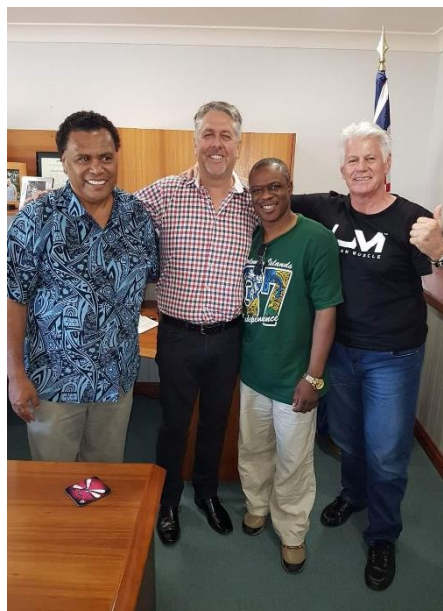
of his team.